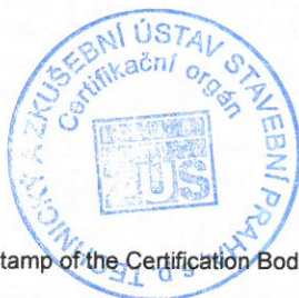
The stamp of the Certification Body

This Annex is an integral part of the certificate No. 070-060600.