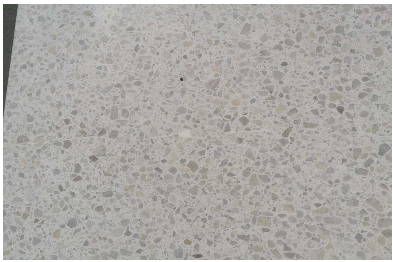
Photo repaired cracks - white terrazzo - the next day, photo close up - about 20cm