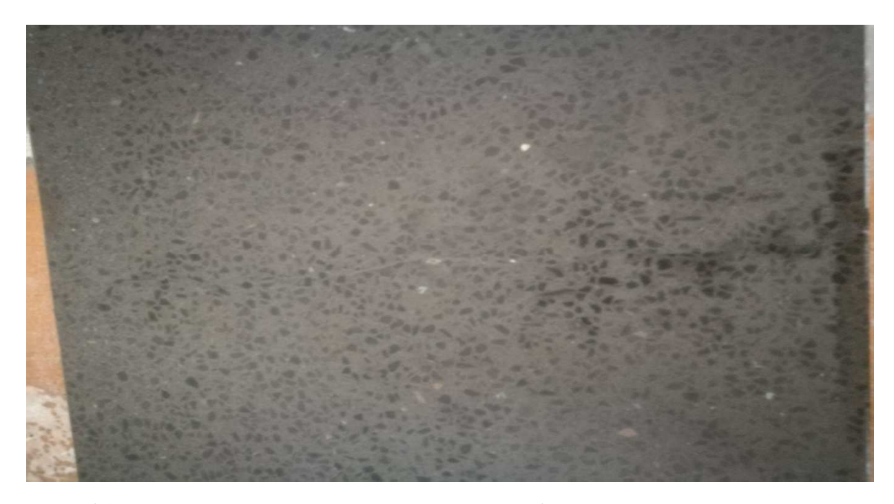
Photo of the repaired joint in the black terrazzo immediately after repair