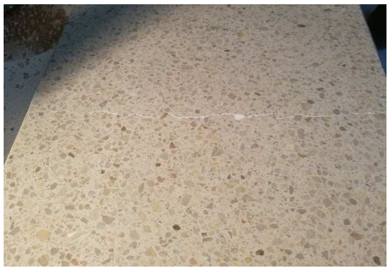
Photo of repaired joints in the terrace immediately after repair - wet surface