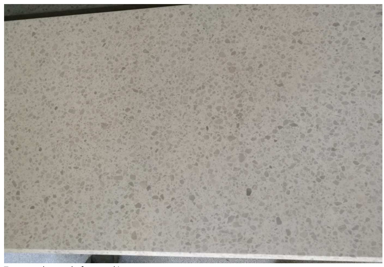
Terrazzo element before cracking

1. Terrazzo crack - on a white terrazzo cladding, we have created a similar crack to that found on construction sites. We also include a black terrazzo element with a crack.